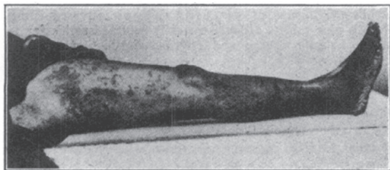
FIG. 1.—Condition before treatment.

On examination the patient seemed obviously ill but not toxic, and was unable to walk or move about normally